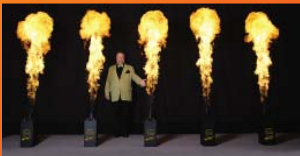
Five SAFEX-FLAMEJETT® in a row

The device is extremely stable and safe manufactured from powder-coated, galvanized steel sheet. It is determined for long use and rough tour business. The aerosol can is protected very well against exterior influences, so that with rule-fair action also pyrotechnic effects can be used together with the effect device. A fastening is provided for a safe state on the stage floor.